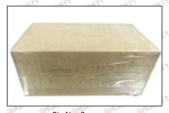
Pic No. 2 Domestic express packaging:

Minors are prohibited from using transparent tape, yellow tape, black wrapping protective film, and white wrapping protective film to avoid personal injury.